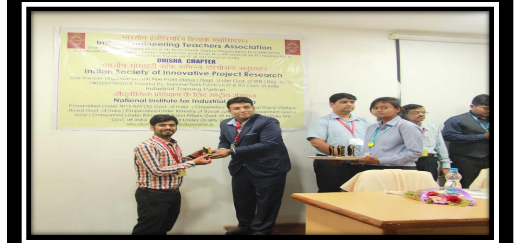
Indian Engineering Teachers Association Odisha Chapter on 23-3-19